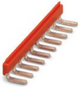
Insertion bridge, pitch: 6.15 mm, number of positions: 10, color: red

Please be informed that the data shown in this PDF Document is generated from our Online Catalog. Please find the complete data in the user's documentation. Our General Terms of Use for Downloads are valid ( http://phoenixcontact.com/download )