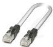
Patch cable, CAT5, assembled, 10 m

Patch cable - FL CAT5 PATCH 10,0 - 2832629