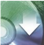
License for mGuard Secure VPN Client v11.x

License - MGuard SECURE VPN CLIENT LIC - 2702579