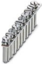
Fixed bridge, pitch: 5 mm, number of positions: 10, color: silver

Please be informed that the data shown in this PDF Document is generated from our Online Catalog. Please find the complete data in the user's documentation. Our General Terms of Use for Downloads are valid ( http://phoenixcontact.com/download )