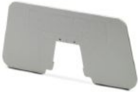
The figure shows the product version UHV-TP 1

Separating plate, length: 180.2 mm, width: 2 mm, height: 68.3 mm, color: gray