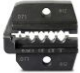
Replacement die for crimping pliers CRIMPFOX-1,6/2,5-ED-4,0

Replacement die - CRIMPFOX-1,6/2,5-ED-4,0 DIE - 1886948