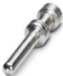
Turned 2.5 crimp contact, individual male contact, core diameter 1.5 mm 2 , silver-plated

Please be informed that the data shown in this PDF Document is generated from our Online Catalog. Please find the complete data in the user's documentation. Our General Terms of Use for Downloads are valid ( http://phoenixcontact.com/download )