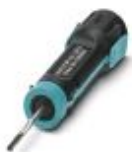
Assembly tool, for CK 1.6... crimp contacts for small conductor cross sections

Assembly tool - UNIFOX MT-CK 1.6/2.5 - 1089092