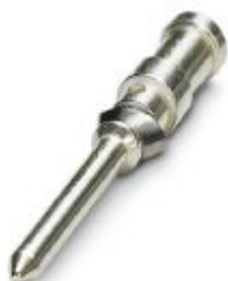
Turned 1.6 crimp contact, individual male contact, core diameter 2.5 mm 2 , silver-plated

Please be informed that the data shown in this PDF Document is generated from our Online Catalog. Please find the complete data in the user's documentation. Our General Terms of Use for Downloads are valid ( http://phoenixcontact.com/download )