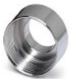
Step-up adapter, M32 to M40, including O-ring

Extension adapter - ENLAR-M-KV-M32/M40 - 1647682