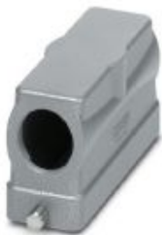
HEAVYCON B24 sleeve housing, for single locking latch, height: 65 mm, with 1 x M32 thread, lateral cable outlet

Please be informed that the data shown in this PDF Document is generated from our Online Catalog. Please find the complete data in the user's documentation. Our General Terms of Use for Downloads are valid ( http://phoenixcontact.com/download )