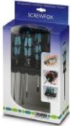
Screwdriver set, bladed/crosshead Pozidriv ® , 6-part, incl. rack

Please be informed that the data shown in this PDF Document is generated from our Online Catalog. Please find the complete data in the user's documentation. Our General Terms of Use for Downloads are valid ( http://phoenixcontact.com/download )