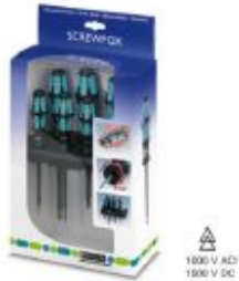
Screwdriver set, bladed/crosshead Phillips Recess ® , VDE insulated, 6-part, incl. rack

Please be informed that the data shown in this PDF Document is generated from our Online Catalog. Please find the complete data in the user's documentation. Our General Terms of Use for Downloads are valid ( http://phoenixcontact.com/download )