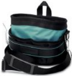
Tool bag, unequipped

Please be informed that the data shown in this PDF Document is generated from our Online Catalog. Please find the complete data in the user's documentation. Our General Terms of Use for Downloads are valid ( http://phoenixcontact.com/download )