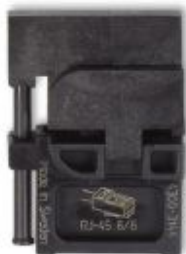
Die, for Crimpfox-M, for unshielded RJ45 connectors, packed in a serial storage box

Please be informed that the data shown in this PDF Document is generated from our Online Catalog. Please find the complete data in the user's documentation. Our General Terms of Use for Downloads are valid ( http://phoenixcontact.com/download )