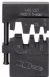
Die, for Crimpfox-M, for ferrules 0.25 - 10 mm 2 , packed in a serial storage box

Please be informed that the data shown in this PDF Document is generated from our Online Catalog. Please find the complete data in the user's documentation. Our General Terms of Use for Downloads are valid ( http://phoenixcontact.com/download )