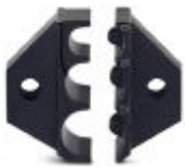
Spare die for CRIMPFOX-RC 25

Replacement die - CRIMPFOX-RC 25/DIE - 1212299