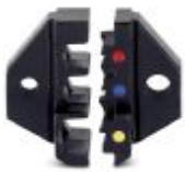
Spare die for CRIMPFOX-RCI 6-1

Replacement die - CRIMPFOX-RCI 6-1/DIE - 1212290