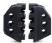
Spare die for CRIMPFOX-SC 6

Replacement die - CRIMPFOX-SC 6/DIE - 1212051