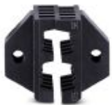
Spare die, for CRIMPFOX 50R

Replacement die - CRIMPFOX 50R/DIE - 1212042