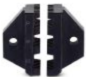
Spare die for CRIMPFOX 25R

Replacement die - CRIMPFOX 25R/DIE - 1212040