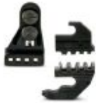
Replacement die, for CRIMPFOX-MT

Replacement die - CRIMPFOX MT 2,5 DIE - 1208050