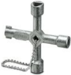
Control cabinet key, metal, for all common types of control cabinet

Please be informed that the data shown in this PDF Document is generated from our Online Catalog. Please find the complete data in the user's documentation. Our General Terms of Use for Downloads are valid ( http://phoenixcontact.com/download )