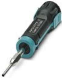
Contact removal tool, for turned and rolled CK- 1.6-... contacts

Please be informed that the data shown in this PDF Document is generated from our Online Catalog. Please find the complete data in the user's documentation. Our General Terms of Use for Downloads are valid ( http://phoenixcontact.com/download )